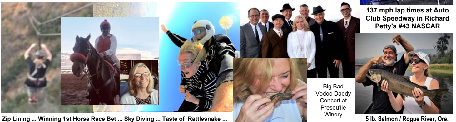
Zip Lining ... Winning 1st Horse Race Bet ... Sky Diving ... Taste of Rattlesnake ...

... and when I'm not working, I've been turning some of my "bucket list" thoughts into actual experiences: