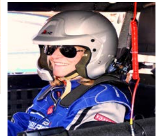
137 mph lap times at Auto Club Speedway in Richard Petty's #43 NASCAR

... and when I'm not working, I've been turning some of my "bucket list" thoughts into actual experiences: